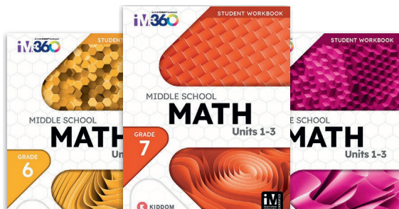
Custom printed student workbooks, teacher guides, and resources